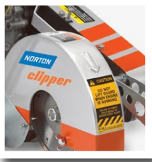
Front Blade Mount

Whether you cut green, cured, or are in the decorative concrete business, the GC55 and GMax blade are the perfect combination!