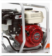
Compact Frame Design