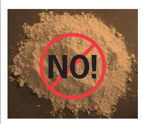
An example of fine, powdery sand, or silt, which is not recommended for screed mixing.

Round particles - Round particles roll against one another and decrease stability.