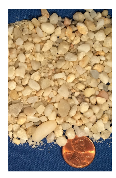
Recommended sand aggregate for ARDEX screeds.