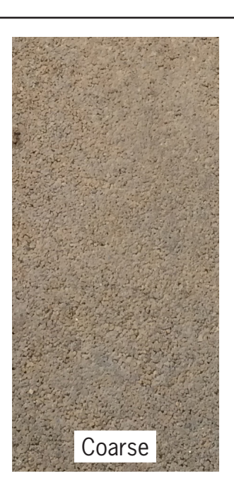
At left, ARDEX A 38 mixed with fines. At right, ARDEX A 38 mixed with proper aggregate. Note that the material on the right has a coarser texture.

ARDEX Engineered Cements 400 Ardex Park Drive Aliquippa, PA 15001 USA Tel: 724-203-5000