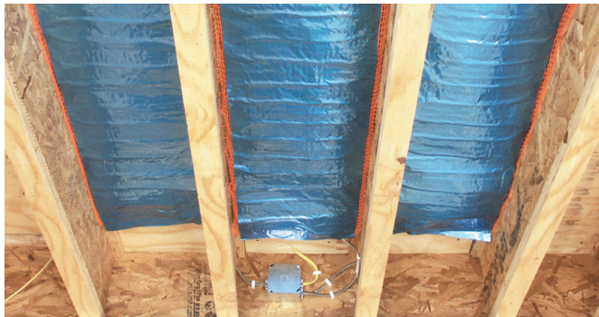
SunTouch UnderFloor - multiple joist bays