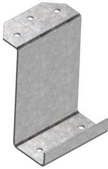
15 - JOIST BRACKETS