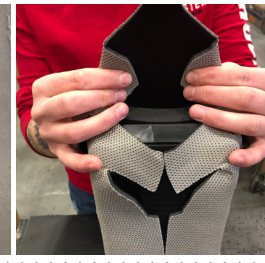
Firmly attach center peak to the Hook 6b Strip at the top/center of the frame.