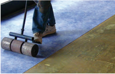
2. Embed NobleSeal TS with a roller.