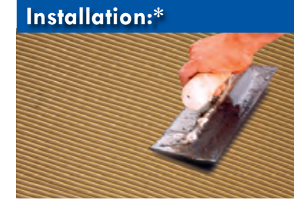
Apply Bonding agent (NobleBond EXT or latex modfied thin-set).